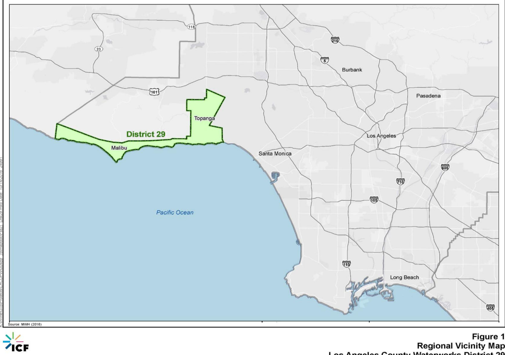
Figure 1 Regional Vicinity Map Los Angeles County Waterworks District 29